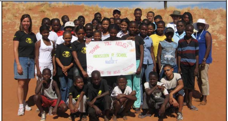
Hoeksteen Primary School at NaDEET

In June, NaDEET, in conjunction with the Namibian Environment and Wildlife Society (NEWS), sponsored an essay contest among Southern Namibian schools. Learners were asked to explore the topic: "Apathy and the Environment". Students in the Hardap and Karas regions were challenged to write about their local environments and communities. How do their local communities act towards the environment — are they concerned and respectful or do they show little or no interest and concern? We received entries from 11 different schools. Each participant received a Certificate of Participation. The first prize was an all expenses paid visit for the learner's class to NaDEET Centre.