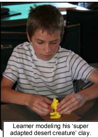
Learner modeling his 'super adapted desert creature' clay.