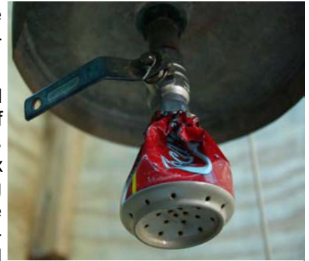
NaDEET Centre's 'new' recycled shower heads

We had one case where this led to a great recycling idea. After having several bucket showers at NaDEET Centre break due to wear and tear (6 years of kids took their toll), we had run out of the relatively expensive shower heads and desperately needed one more before a group arrived. After trying to fix the broken shower head unsuccessfully, we started to listen to voices saying "just build one yourself." Putting heads, minds and hands together we came up with a great recycled tin shower head. As waste seems to be always present, we are very grateful that this worked out well because we can now find an old tin and make a new shower head as needed. As we continue to build more shower heads, I am sure that we will improve on this design.