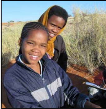
Girls from JR Camm and Rooiduin schools visit NaDEET for the first time.