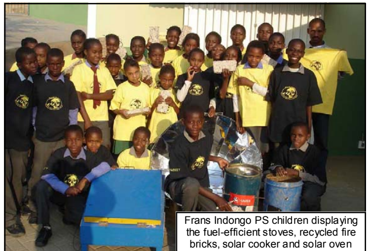
Frans Indongo PS children displaying the fuel-efficient stoves, recycled fire bricks, solar cooker and solar oven they demonstrated to parents and community members at their "Back to School Open Day"

Since July, eleven other school groups have also participated in our week-long environmental education programme. Many of these groups were repeat schools who have made a visit to NaDEET Centre an annual trip for their classes. We are pleased that eight of these schools were from the Hardap region, as we aim to work with children from our local area. New groups included Onyose Trust, a non-profit organisation for people with disabilities who we hosted in November, and JR Camm and Rooiduin schools who were brought to the Centre by Peace Corps volunteers.