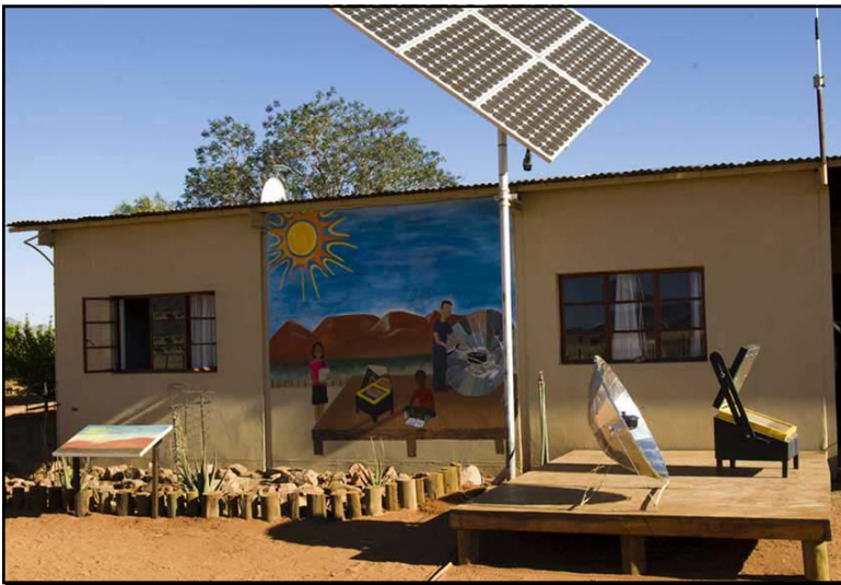
New solar deck, mural and information signs in front of the NaDEET office.

We also had a mysterious water problem at the Centre at night as the taps of the solar hot water geysers (where kids fill their buckets for showers) were opened. After several unsuccessful attempts, it was clear that the culprit was an injured male oryx that had learned to open but not close the taps for a good drink. He was probably injured during a territorial fight and pushed away from the normal water sources. As it was an enormous water waste to us, we were grateful when the Reserve allowed putting an end to his suffering.