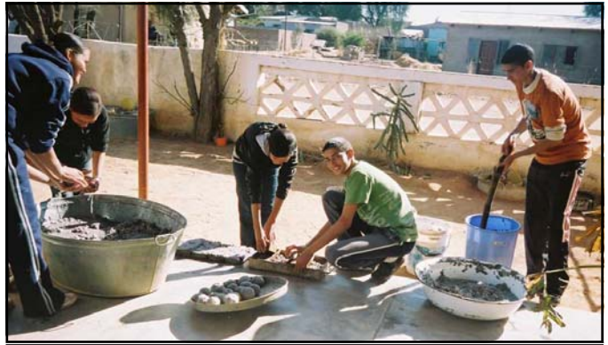
Rehoboth HS learners make their own newspaper fire bricks (above) and use them to cook a traditional chicken stew (below).