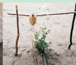
The new tippy tap at Ngewze PS