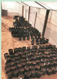
Our tree nursery

A monitoring system using the EpiCollect App has been put into place that we can track and monitor the success rate. We hope that we have developed a good working model that is repeatable and could be also used in many other situations.