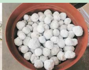
Kaisosi PS made recycled fire balls