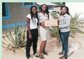
Handing over materials at Isize Combined School