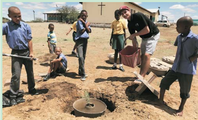
Planting at Nabisib Primary School and Hostel