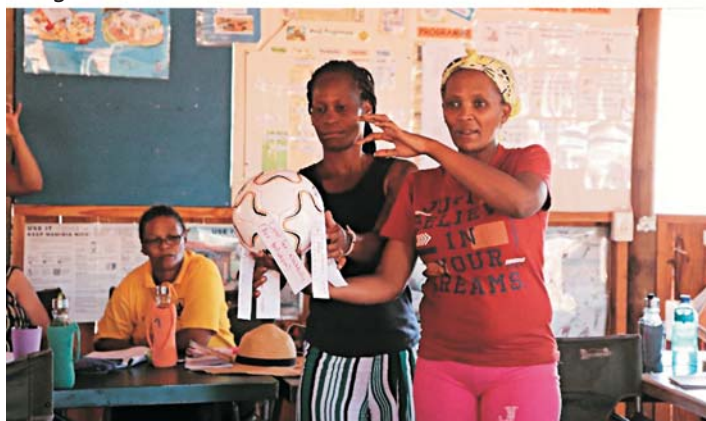
Hardap Region teachers giving feedback on environmental problems: The soccer ball represents the Earth. The more problems that hang on it, the more it will be pulled down!