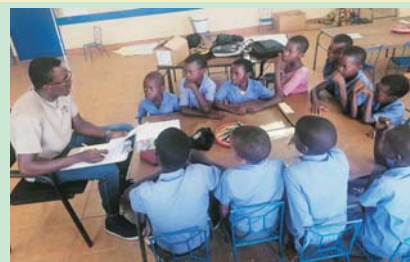
Group interview at Mbeyo PS

Most learners had a positive attitude towards the environment. Some learners in rural areas use water wisely as they have to walk long distance to get water to use at school while as those in town who just get water at their taps. I could tell that the teachers are really doing their part as some learners gave good responses. Most learners said they enjoyed tracing and matching images in the ITTG books.