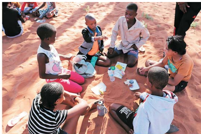
Schoolchildren from AA Denk PS playing the "What is the Environment?" game.