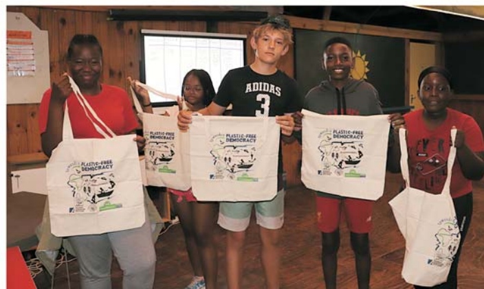
Thank you to Konrad Adenauer Stiftung and Woermann & Brock for donating these reusable shopping bags. The bags are given out to secondary school participants as prizes for doing well in the environmental quiz.