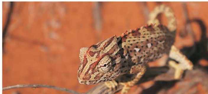
One of the chameleons seen on the dune walk during the UNESCO staff retreat. A rare sighting in recent years!