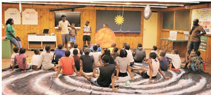
Kalkrand PS exploring the Milky Way galaxy during the astronomy activities before going outside to see the real thing.