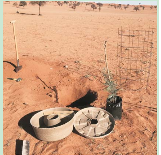
Planting around NaDEET Base with the cocoon and mesh fence

To improve the success rate of the planting in the dry desert area, we are using the Cocoon tree planter, which we had tested successfully two years ago. The Cocoon increases the survivability of younger plants by providing water and protection over the crucial first few weeks after planting. In addition, we then also added a protective fence that is visually unobtrusive in the distance around each tree. This will allow us to also plant trees further in the field away from areas that can be watered regularly.