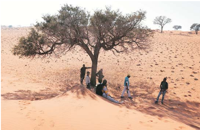
Enjoying the shade of a camel-thorn tree.