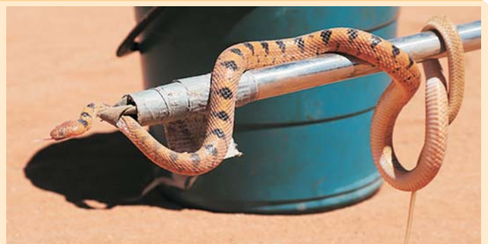
With summer time approaching, our reptilian neighbours are also more active. A Western Tiger Snake was found that most likely travelled to NaDEET Base by hitching a ride on a vehicle.