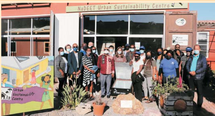
UNESCO Windhoek Office together with the Namibia National Commission visited the Centre for an afternoon.