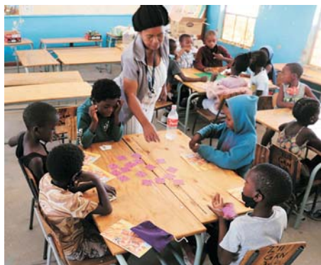
Grade 2s learning with our lower primary educational resource "It's Time to Grow".