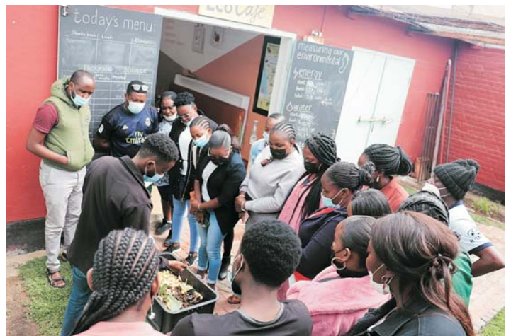
Exploring the worm compost at the Urban Centre kitchen.